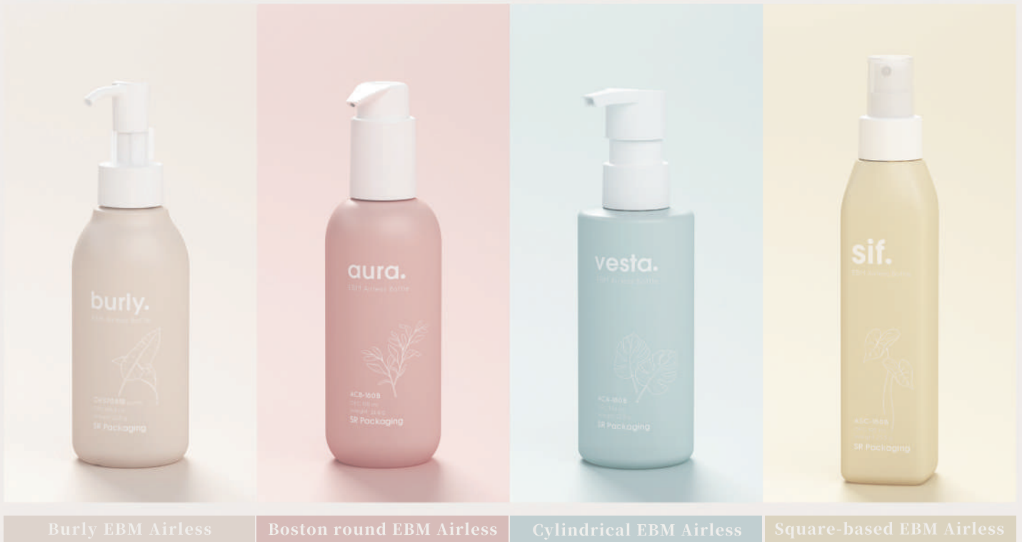
Burly EBM Airless